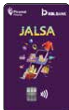
Piramal card face Annual Fees INR 999 + GST Mastercard Rupay