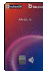
IndianOil RBL Bank XTRA Credit Card Annual Fees INR 1500 Mastercard Rupay