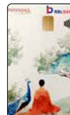
RBL Bank Patanjali Vishisht Credit Card Annual Fees INR 499 + GST Rupay