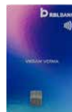
Shoprite Annual Fees INR 500 Visa Mastercard