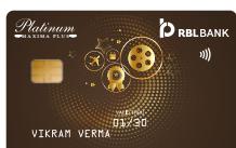
Platinum Maxima Plus Annual Fees INR 2500 Visa