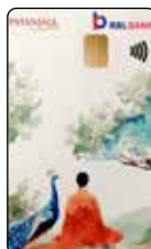
RBL Bank Patanjali Swarn Credit Card Annual Fees INR 1499 + GST Rupay