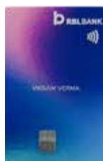
Platinum Delight Annual Fees INR 1000 Visa Mastercard