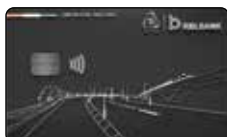
IRCTC RBL Bank Credit Card Annual Fees INR 500 Rupay