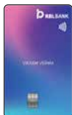
APEX Credit Card Annual Fees INR 1000 Mastercard