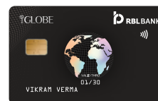
iGlobe Card Annual Fees INR 3000 Mastercard *NRI Customer Only