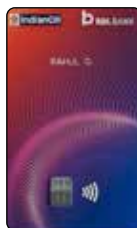
IndianOil RBL Bank Credit Card Annual Fees INR 500 Mastercard Rupay