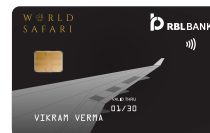
World Safari Annual Fees INR 3000 Visa Mastercard