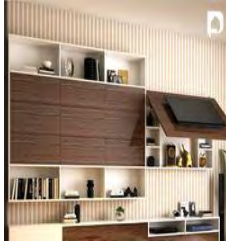
Personalized Home Interior For Every Ta... Design Cafe