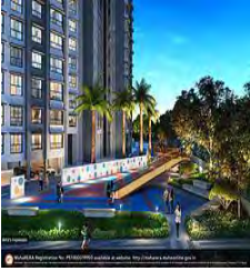
Pre-Launching Codename WinWin... The Wadhwa Group