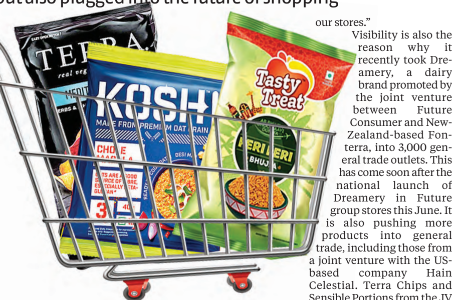
The company is retailing a number of its private and joint-venture brands via general trade outlets